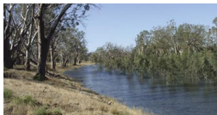
Our floodplain after Red Gum Rescue