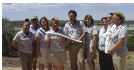
Banrock Station Team with the Games Relay Baton

As the photograph shows, the Baton found its way to Banrock en route to Melbourne – to the excitement of all the staff and people who visited us that day.