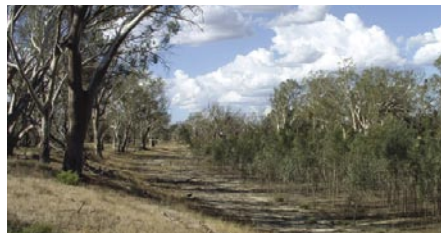
Our floodplain before Red Gum Rescue

A decade has past since the Murray experienced its last major flood, so this initiative will help retain pockets of healthy trees until the next major flood boosts their ability to regenerate.